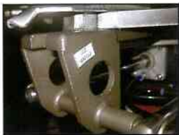
Forged slide guide clamps (one piece)