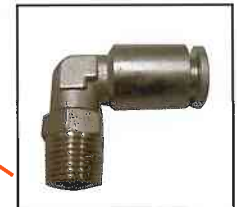
All steel connector