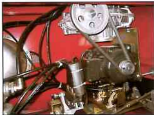
Professional mechanical design