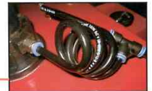
High quality air hoses from Japan