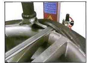
Bead lever work excellent with mounting head