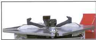
Clockwise and counterclockwise rotation high precision turntable, plus optional upgrade high impact bead blaster system