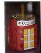
CE reverse switch from Germany