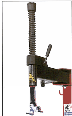
High strength steel swing arm