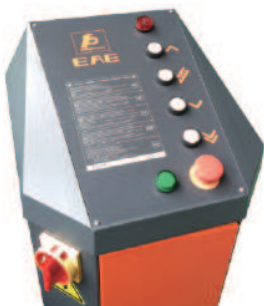
Low Voltage Control Unit