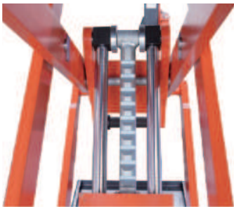
Mechanical Safety Lock