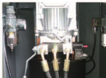
High Quality Ball Valve