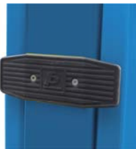
Door Protection Pads