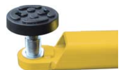
Round Screw-up Lifting Pad

EAE Automotive Equipment Company Limited