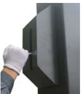
One Side Safety Locks Release