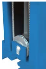
Pulley with Derailment Protection