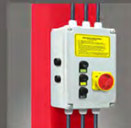
Electro-air safety release