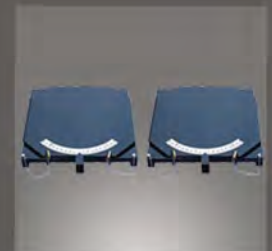
Each Alignment lift needs one set of turnplates