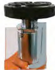
4T130mm Casting Height Adapter