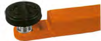
Round Screw-up Lifting Pad

Tufflift Hoists Australia Head Office 46 Saintly Drive, Truganina, VIC 3029 Phone +61 3 8375 3600 Fax +61 3 8353 2525 Email sales@tufflift.com.au Freecall 1800 88 33 50