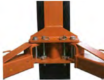
Strong Carriage and Arm Structure