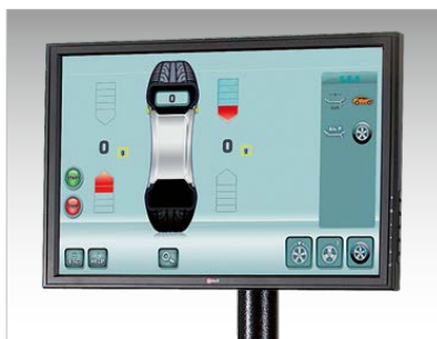
GOLD graphical user interface with touch screen functions

Time-saving and intuitive user interface.