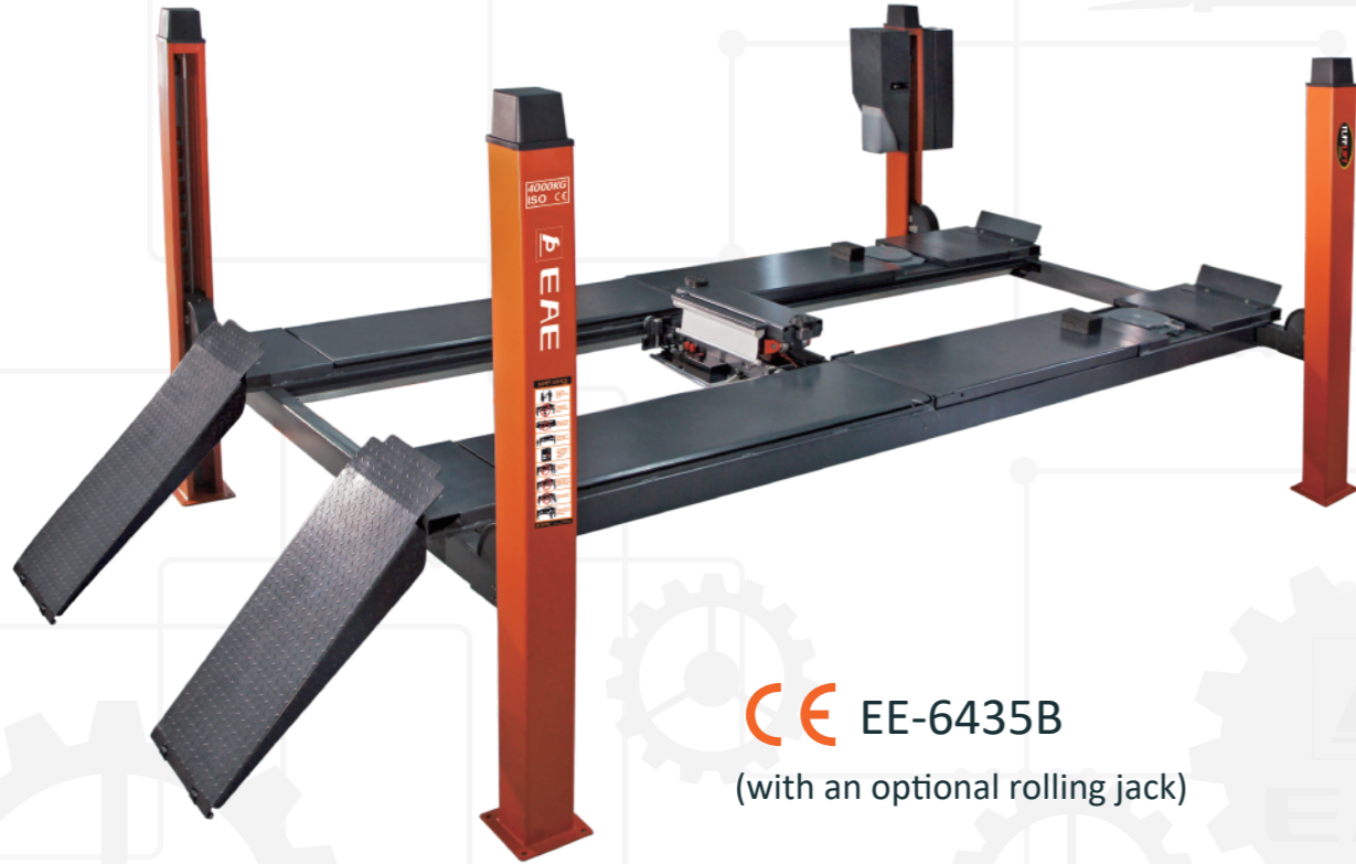
EE-6435B (with an optional rolling jack)

User friendly Electrical Lock Release (E version)