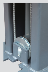
Pulley with Derailment Protection