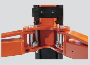
Strong Carriage and Arm Structure