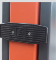
Door Protection Pads