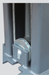
Pulley with Derailment Protection