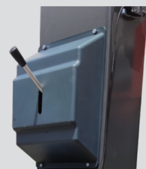
One Side Safety Locks Release