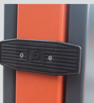
Door Protection Pads