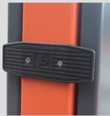
Door Protection Pads