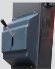
One Side Safety Locks Release