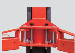
Strong Carriage and Arm Structure