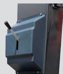
One Side Safety Locks Release