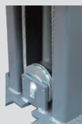
Pulley with Derailment Protection