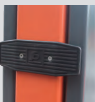
Door Protection Pads