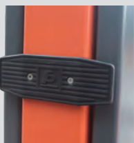
Door Protection Pads