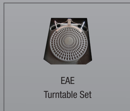
EAE Turntable Set