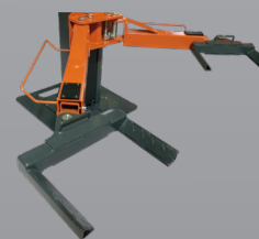
Tyre Holder Adapter