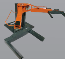
Tyre Holder Adapter