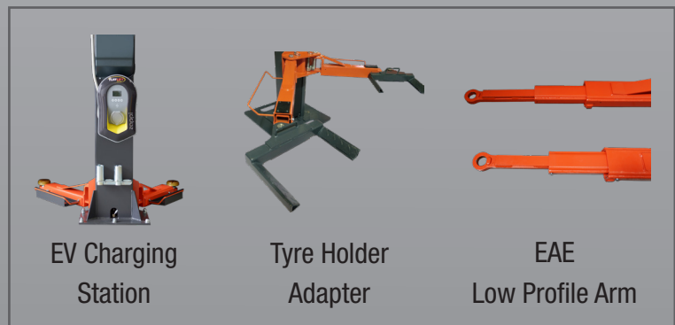
EV Charging Station