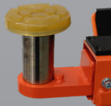
Screw Pad / 4WD Adapter