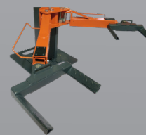
Tyre Holder Adapter