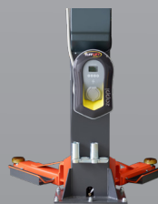
EV Charging Station