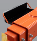
Arm Tool Tray