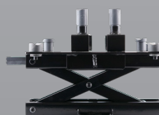
SD1009 Black Jack