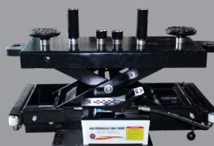
Rolling Jack Air Pump