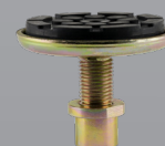
Combination Screw Pads