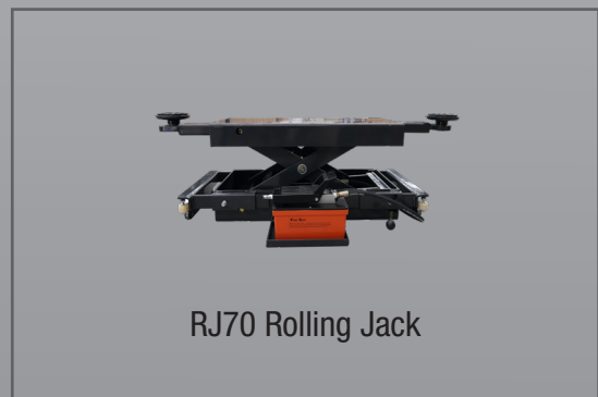
RJ70 Rolling Jack