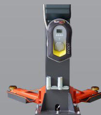
EV Charging Station