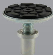
Drop In Screw Pads