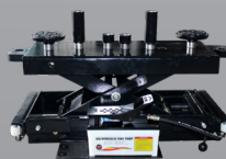
RJ45 Rolling Air Pump Jack