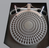
EAE Turntable Set