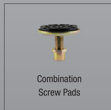
Combination Screw Pads