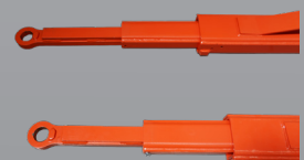
EAE Low Profile Arm