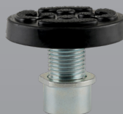
Drop In Screw Pads