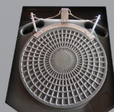
EAE Turntable Set