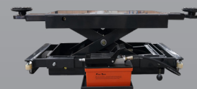
RJ70 Rolling Jack