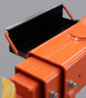
Arm Tool Tray