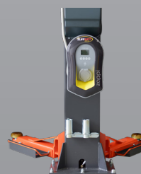
EV Charging Station