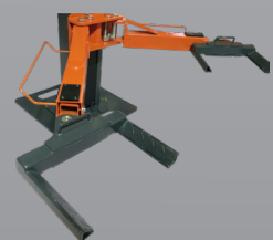
Tyre Holder Adapter